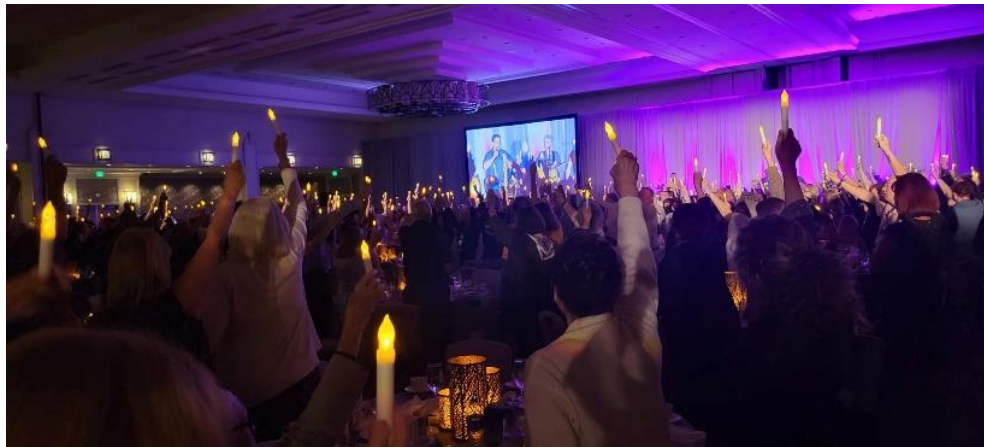
TCF North Shore-Boston Chapter Attendees